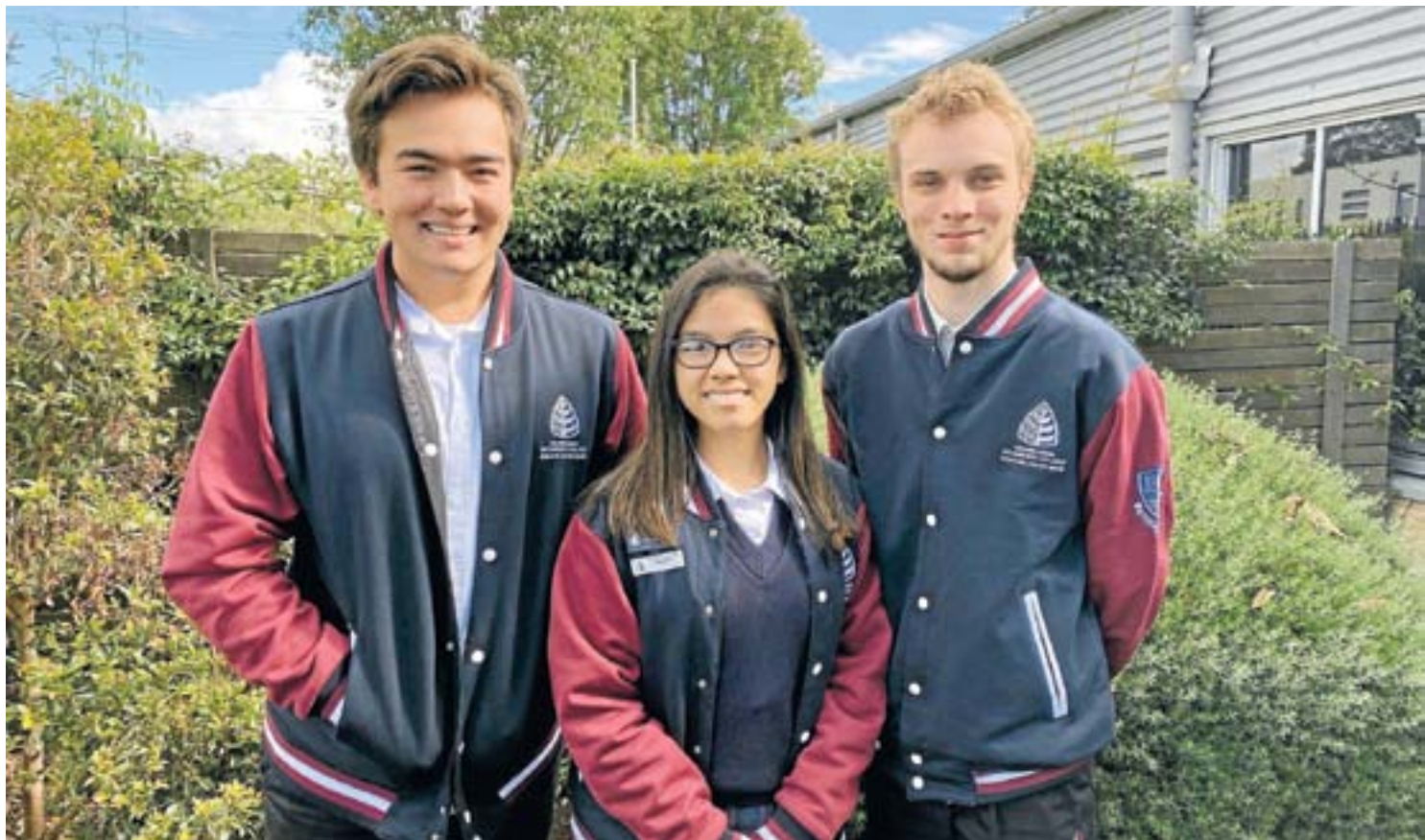
Our College includes outstanding facilities across curriculum areas as well as student support services. 236517

The College also provides access to VCAL