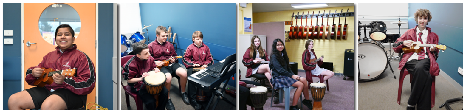
Year 7's practising rhythm while playing bongo drums and ukuleles