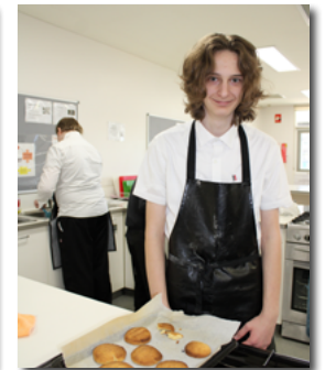
Year 8 & 10 students prepared, crudites, biscuits and souffles in their Food Studies classes