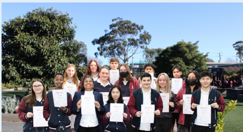
Year 11 & 12 Australian Geography Competition participants

In April, Year 11 and 12 VCE Geography students participated in the Australian Geography Competition. This is a contest for Australian secondary school students, assessing their geographical knowledge and skills, and to encourage student interest in Geography.